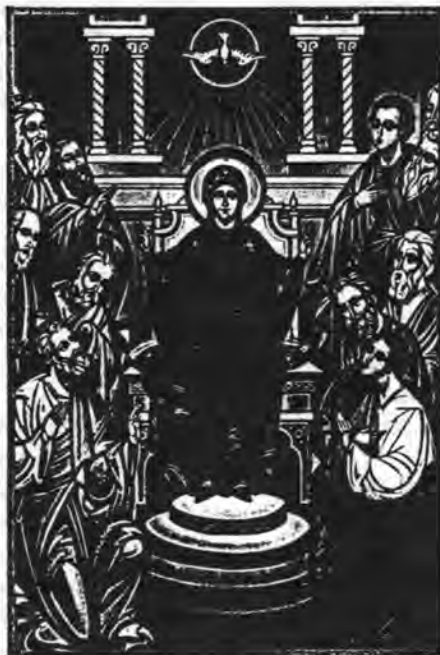
Descent of the Holy Spirit

Though I have not done so in a direct and explicit way, I believe that the challenge laid down for the Secular Carmel is the same that the Church must face today: the work of inculturating the new evangelization in the different social contexts. We have in mind for 1996, an international congress for the Secular Order. The preparation for this in dialogue with the members throughout the world, will permit us to form a new approach for renewal and