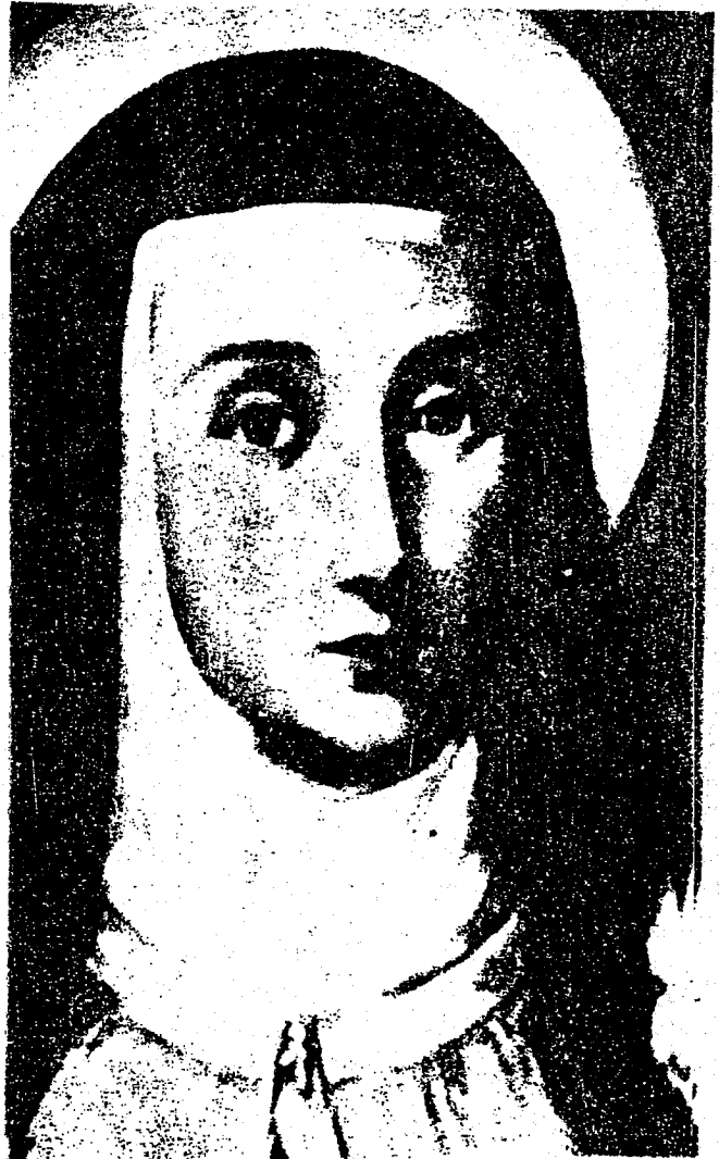
St Teresa Margaret Redi, OCD, was impressed with God's love. (Cf. Rule, Art. 2, line 4) Her feastday is Sept. 1st.