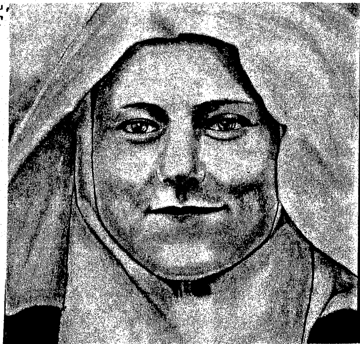
St Therese of Lisieux

Then, when we arrived, one brother grabbed the slide presentation task. The other declared he would explain to people the big back wall with its pictures of Carmel around the world. I was in trouble!